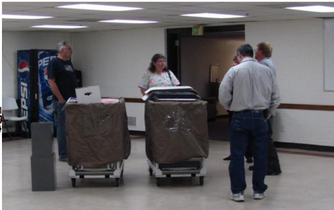
Proposed Meeting Location: Roy City Administration Bldg