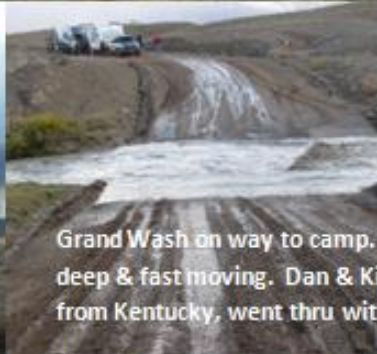
Grand Wash on way to camp. Water 2 1/2 ft deep & fast moving. Dan & Kim Gray, members from Kentucky, went thru with Jeep. We did not.