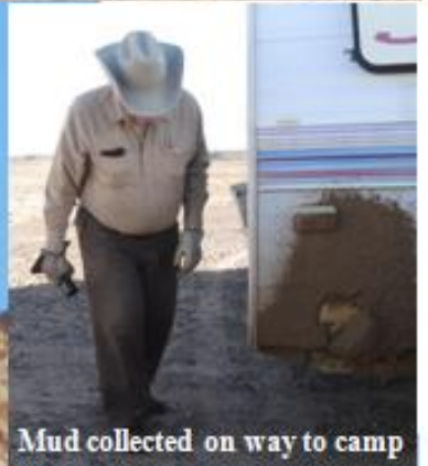
Mud collected on way to camp