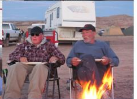
In the morning at camp