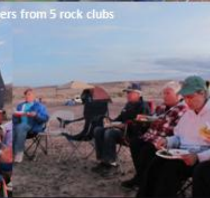
Around the campfire and eating