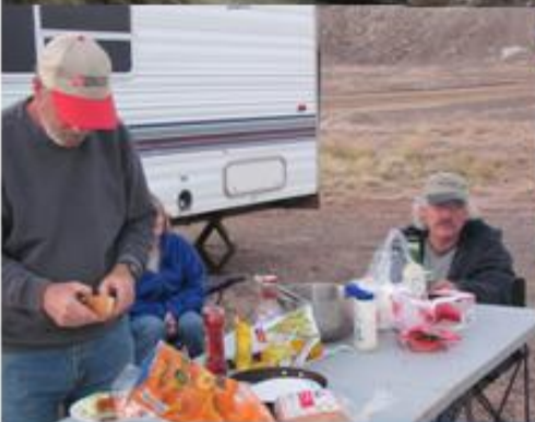
Potluck dinner with members from 5 rock clubs