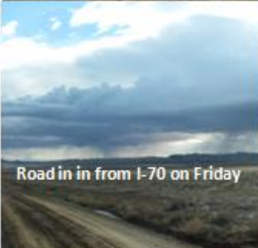
Road in in from I-70 on Friday