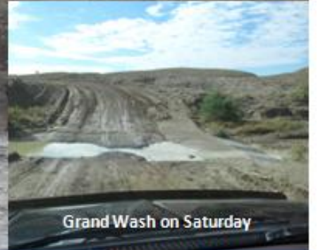
Grand Wash on Saturday