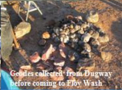
Geodes collected from Dugway before coming to Floy Wash