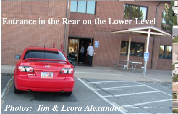
Entrance in the Rear on the Lower Level