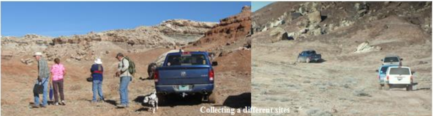
Collecting a different sites